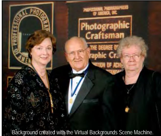
Background created with the Virtual Backgrounds Scene Machine.

"I love humor, I love people, I love making them laugh, and I love making photographs of them that they love."