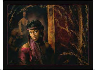
This image was captured by Joseph & Louise Simone in the 10x10 shooting area of the Virtual Backgrounds trade show booth at WPPI. Imagine what you can do in your own studio!