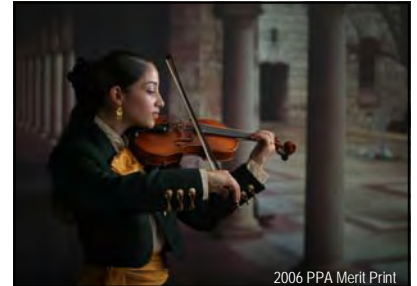
2006 PPA Merit Print